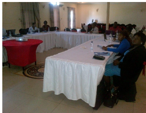
Above: Some photos of the Rice Standards Technical Committee members working at Gonde Lodge, Kabwe.