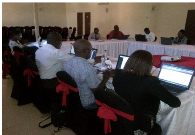
Above: More photos of the Rice Standards Technical Committee members working at Gonde Lodge, Kabwe.