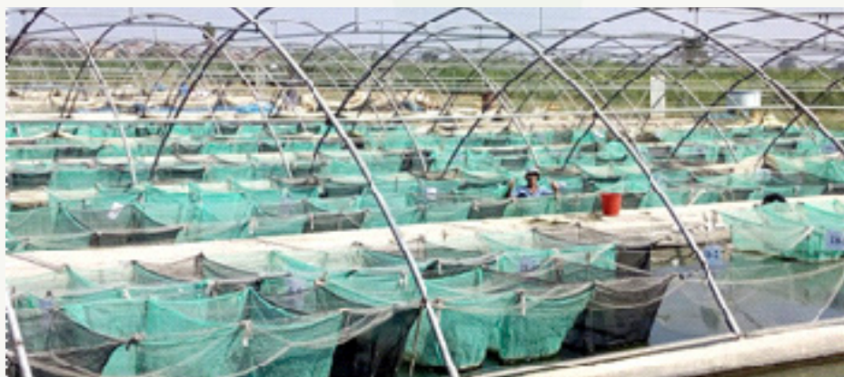
Figure 1: Mass Production of Fingerlings in Hapa (a cage like, rectangular or square net impoundment placed in a pond for holding fish)

The second webinar attracted over 600 participants, 24% female and 41% being youth. Prof. Bernadette Fregene, the TAAT Aquaculture Compact Leader, hosted by World Fish International, presented three categories of technologies being scaled out in Burundi, Cameroon, Cote d'Ivoire, Republic of Benin, Tanzania, Togo, DRC, Ghana, Kenya, Malawi, Nigeria, Zambia. a) Fast-growing disease resist fish seeds and improved fish rearing system b) Quality low-cost fish feed using locally available raw materials c) Improved post-harvest technologies and product development