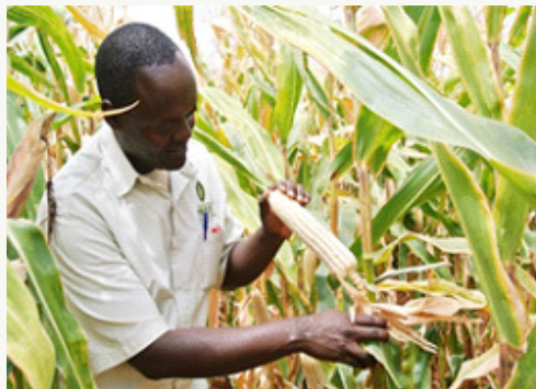
Figure 3: WEMA Seeds at Production Sites