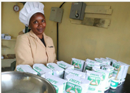
Figure 4: Whole Grain Flour: Processor linked to TAAT Maize farmers displays finished whole grain flour from climate smart maize hybrids ready for the market, Kenya, 2019

Food chain millers which are an agribusiness beneficiary of the maize compact and a member of Agroprocessors Association of Kenya (APAK) has been able to employ youth and women in the milling premises. They also buy grains from off-takers and process into finished products such as maize flour. The compact recorded rapid adoption of climate-smart maize hybrid seeds by millers due to the customer preferences in taste, grain quality and flour texture.