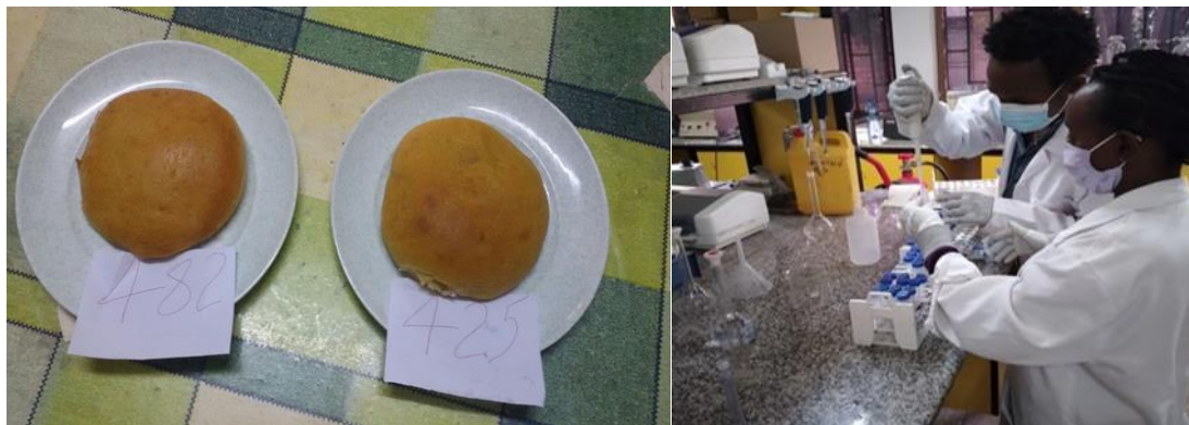
Figure 1 Bread baking and nutritional analysis

Bread baking was performed based on the method of Malik et al. , (2015) bread baking procedure (straight dough method). All ingredients flour (100 g blended), salt (2.5 g), water (65 ml), and yeast (2.5g) were added at the mixing stage and kneaded to obtain uniform dough. The dough samples were placed in baking pans smeared with vegetable oil and was covered for the dough to ferment resulting in gas production. The dough was then baked in an oven (Electric ovens SIMPLY 2T, China) at an average temperature of 230°C for 30 minutes. The baked loaf was carefully removed from the pans and allowed to cool and then packaged in Polyethylene bags for further analysis.